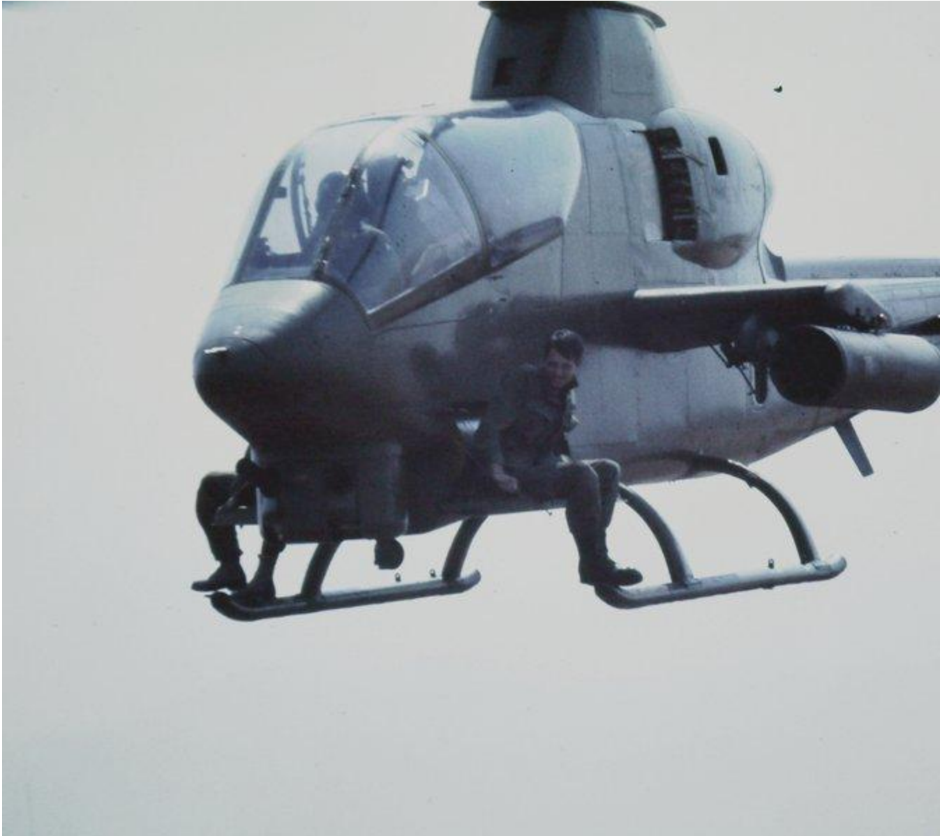
Approaching the landing spot