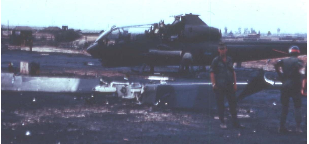
Rotor system lying between the ships.