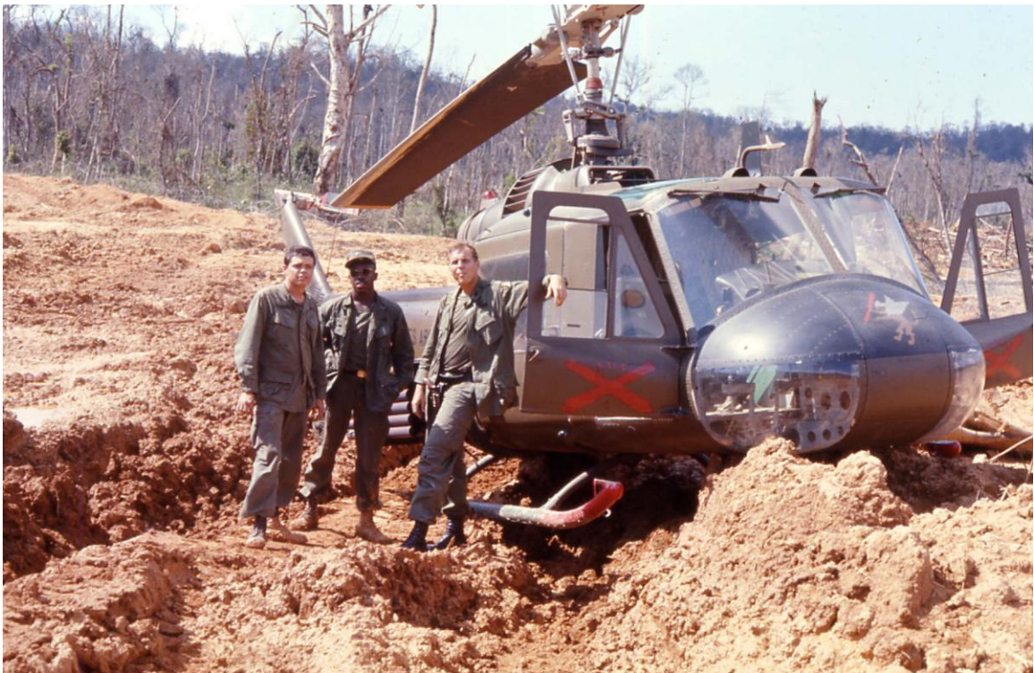
First engine failure.

"I got ahold of Kaiser again. You were right, Roger. He didn't understand the first message, but he knows where we are now." Justin turned and looked up toward a small rise behind them. "Hey, did you know those tanks were there?"