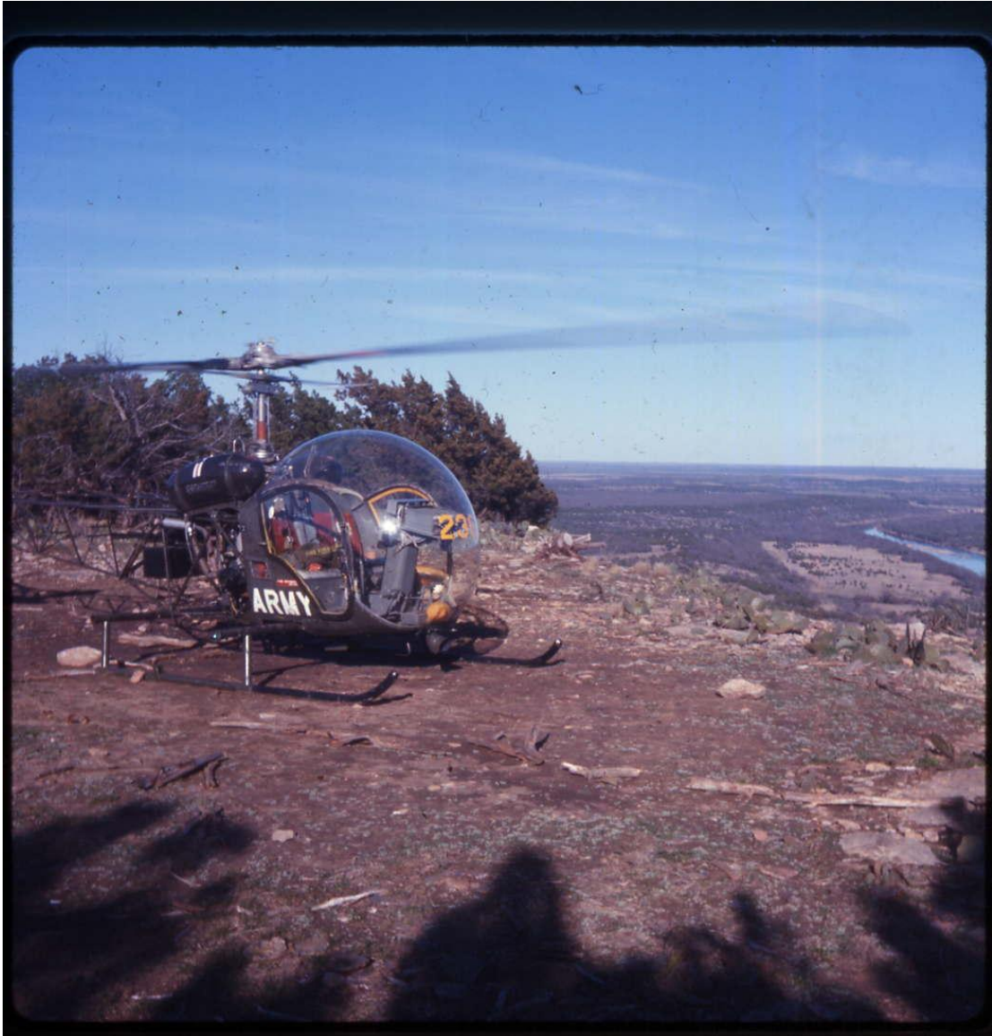
Confined area practice at Ft. Wolters