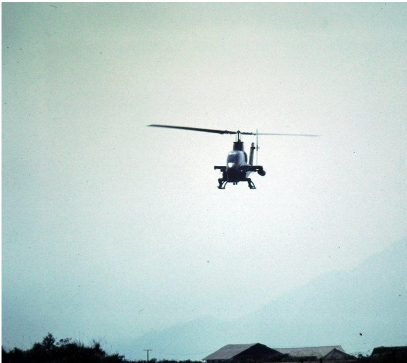
Cobra approaching Camp Evans with rescued pilots.

quickly turned and closed it. Smart did the same. As the ship lifted off for the refueling area, Smart and Hunter were greeted warmly by the assembled troops.