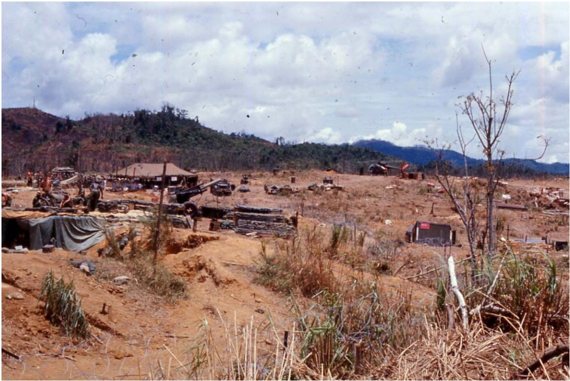
Currahee. Hamburger Hill just over the top of the parked helicopter (LOH).

The early part of May opened with plans for a large assault on the Ashau Valley. Preparations for ARA units were quite involved because the ARA had to help prep the LZ's that were to be used for troop insertions along the western flank of the valley. Few enemy positions of either .50 caliber or 37 mm. anti-aircraft weapons were known. Everyone would be largely on their own. Backup sections would be available from Camp Evans. If the action was heavy around the LZ's, then two sections were to standby at Blaze. A FSB had been established on the valley floor just west of the road entry into the valley. It was named Currahee, and was about centrally located north to south in the valley as well.