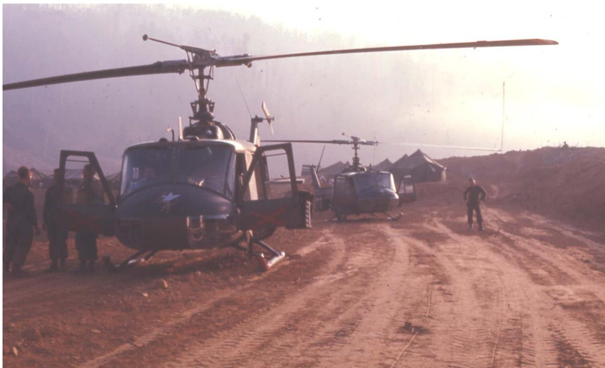
Parking at Blaze.

looked like this was a much better area. It was, until the first ship landed. FSB Blaze was west of Ann, and rested on the slopes overlooking the Song Bo River. It was just a little closer to the Ashau Valley. C Battery's parking area here was a joke. A finger ridge jutted out from the main hill mass. Along the top of this ridge was the chopper refueling area. Just below the crest of the ridge, a narrow bench had been bladed out by a cat. It reminded Roger of a wide logging road cut into the side of the hill. The bench was the parking area for ARA ships. It was only large enough to accommodate two ships. When landing, the pilots had to be careful that they didn't get too close to the bank or they would hit it with one of the main rotor blades. The turbulence set up on the bench by a chopper trying to hover into position to park, was nearly unbelievable. It would literally shake the chopper.