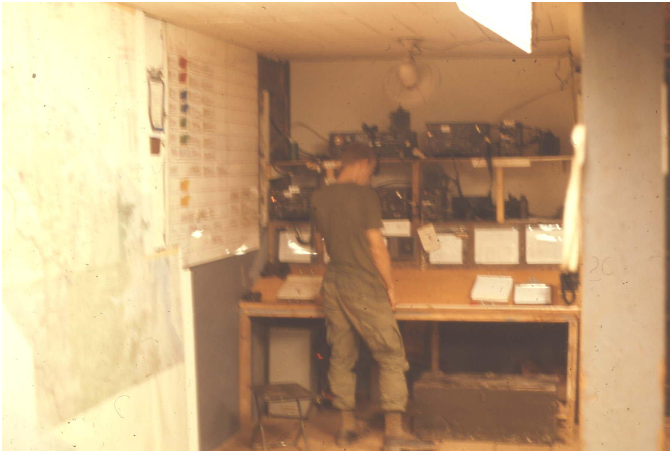
Tactical Operations Center (TOC) at Charlie Battery.