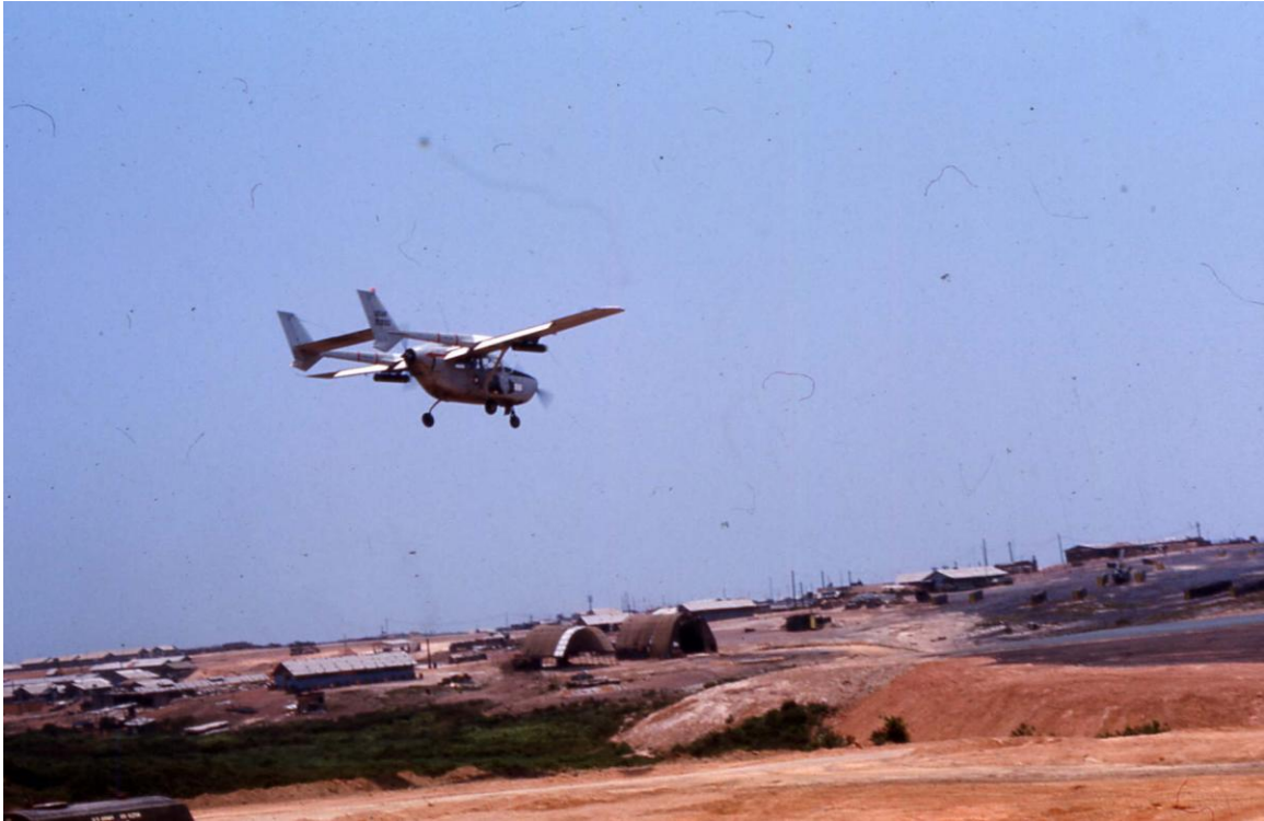
0-2 (Oscar Deuce) FAC aircraft landing at Camp Evans.