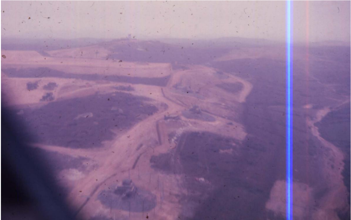
Bunker line at a base perimeter.