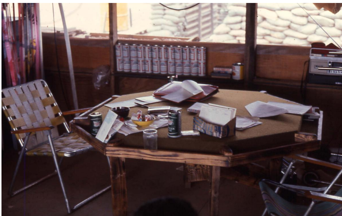
Poker table in 1 st Platoon hootch at Camp Evans.

volleyball net had been set up, and it wasn't long before an earnest game was in progress. It was a nice break from the otherwise steady flow of missions. The other Batteries had agreed to take over C Battery's missions for the day. That night, one of the first movies to reach the unit was shown in the vehicle maintenance tent. It was rather a crude affair, but did provide a little change of pace for evening activities. Otherwise it was poker games, reading books or writing letters. However, the scenes shot with a wide-angle lens were distorted, and the figures appeared tall and thin on the screen. When women were shown, the troops yelled and whistled and generally cut up.