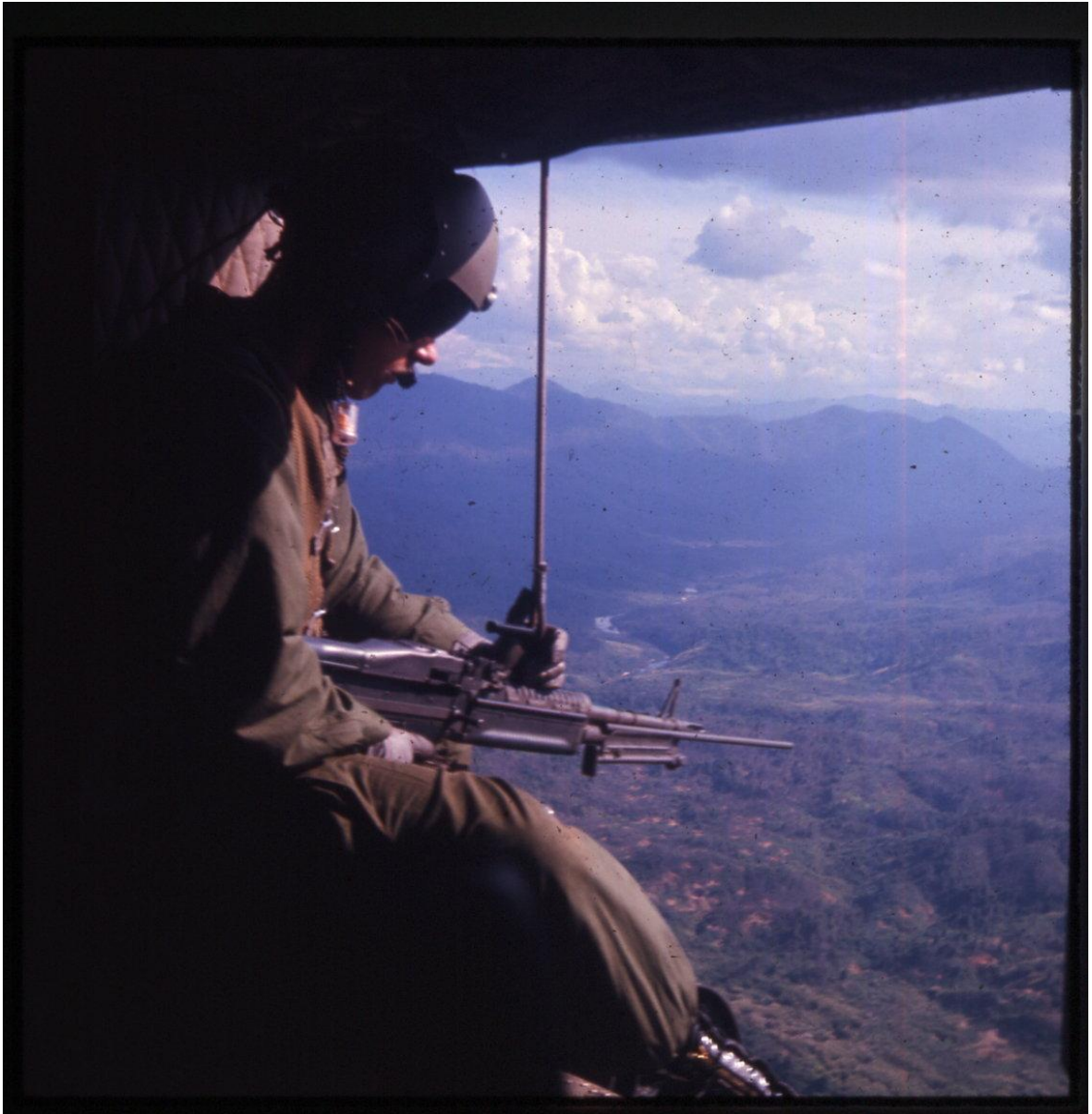
Door gunner - always looking, always ready.