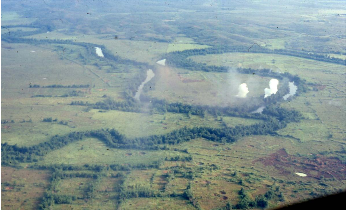
Shooting an LZ prep in the loop of a stream.