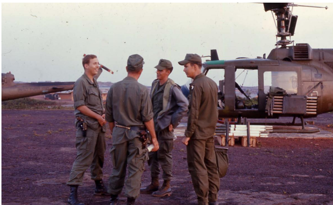
ARA hot spot at Camp Evans. Mess hall in background.