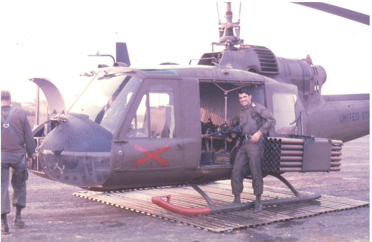
Charlie Battery flight line.