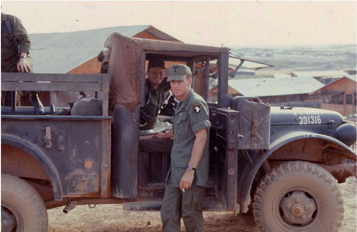
¾ ton used to ferry pilots to flight line.