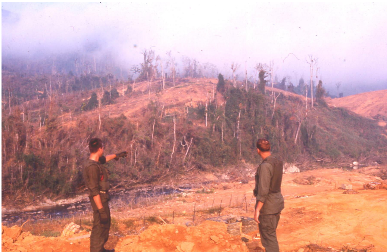
Checking the takeoff path.

ship to land as much room to take off as was possible on the short bench. During hot weather, it was absolutely necessary to bounce the ship at least twice, and usually three times, to get enough speed to get it flying on the takeoff. After they had shut down the engine, Roger and Justin walked the bench, looking carefully for anything that might endanger their takeoff. They stood at the end of the bench for a long time, looking down into the river valley. Below them, a wide area had been cleared of trees. The purpose was to clear fields of fire for the security forces on the fire base, but it also provided the choppers a reasonably clear forced landing area if they should have to abort a takeoff.