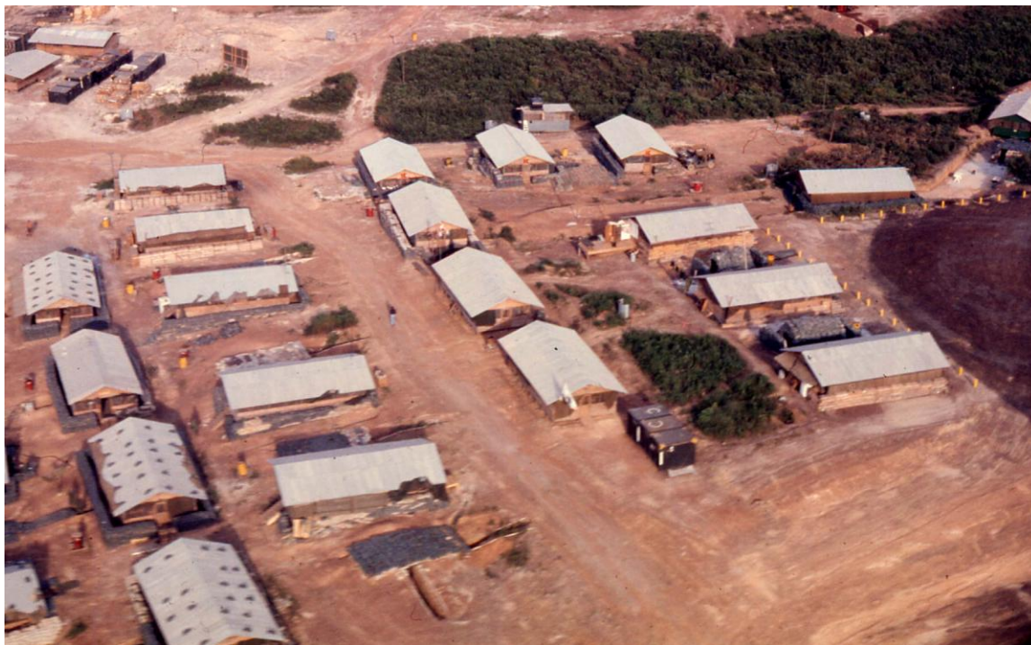
C Battery hootches at Camp Evans.