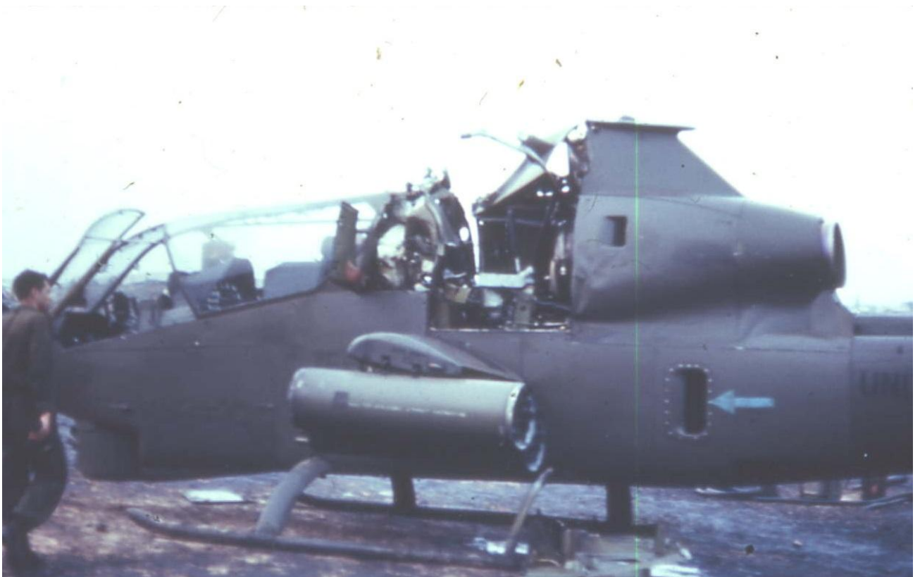
Collision at Sally.

Reaching the nose of the ship, a wide-eyed attendant was looking at the ship. Roger screamed at him, "Hey you! Get me a grounding wire!" The attendant just stood there, slack-jawed, looking at the carnage before him. "Don't just stand there! Get me a grounding wire!" Roger screamed again. The attendant took one last look, and turned and fled. Roger never saw him again. Roger wanted to get the ship grounded as quickly as possible to keep it from blowing up. Stumbling around the aircraft, he reached the open canopy for the front seat.