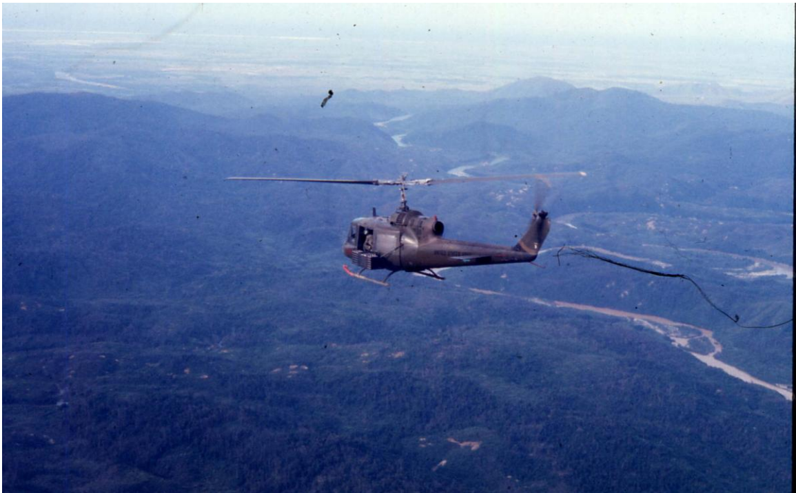
Returning to Camp Evans from the mountains along the Song Bo River.

With the coming of the dry weather, missions poured in. Day after day, the Battery put up every ship that was flyable. The maintenance personnel were working around the clock to keep all the ships flying. It was during this hectic period, that the pilots discovered a neat trick to reduce the number of hits they were taking. The enemy gunners seemed to use the nose of the aircraft as an aiming point. The pilots would kick the aircraft out of trim, so they were side-slipping through the air. Then they would smile and watch the tracers pass by the side of the ship. Return fire from the enemy was becoming more common all the time. And the stories from further north, up near the DMZ (Demilitarized Zone), demonstrated that the enemy up there were getting better training. Most of the hits taken so far by C Battery were in the tail boom or tail fins of the aircraft. Further north, the hits centered in the cockpit area, or so the stories went.