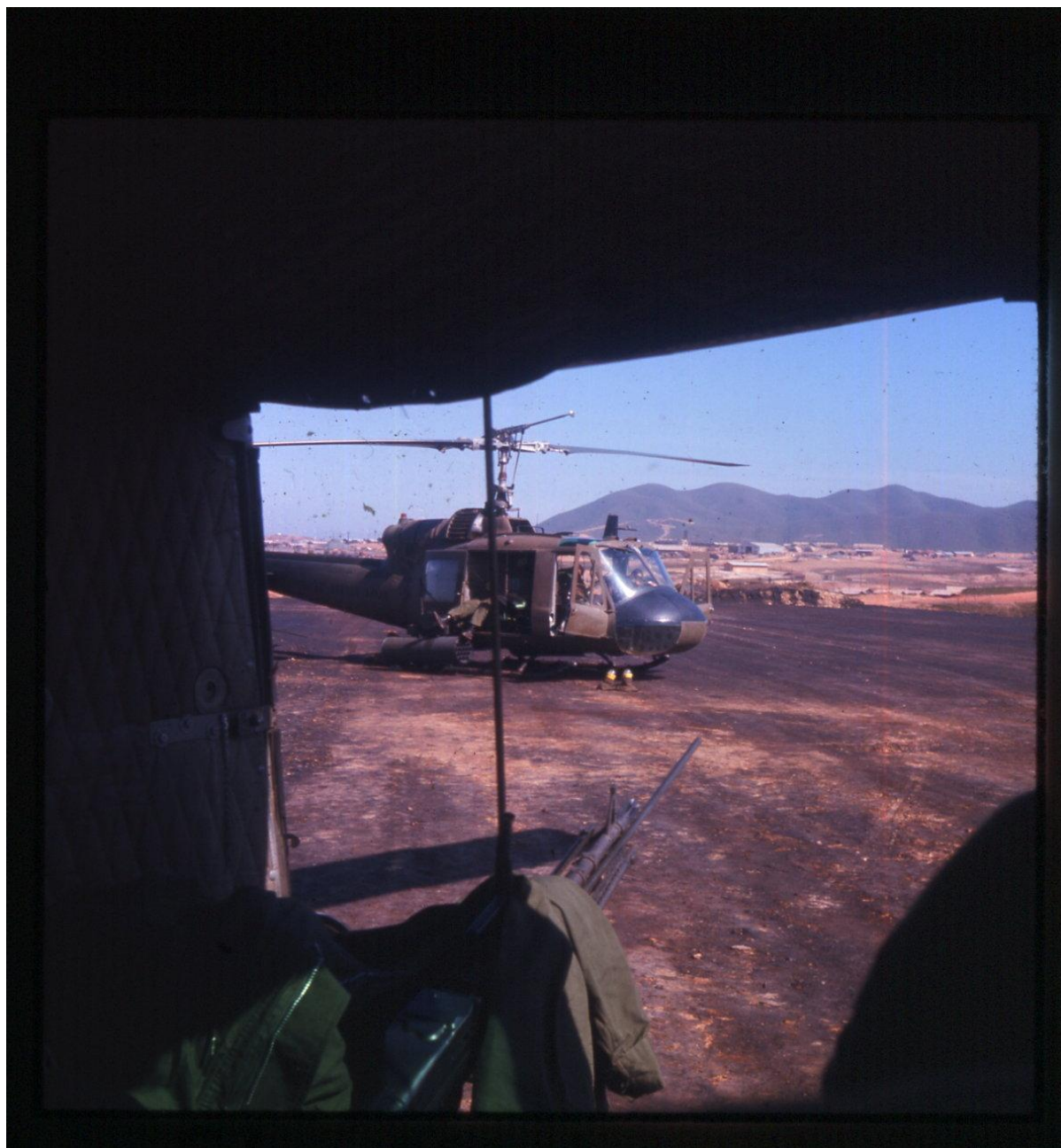
Waiting on flight line at Camp Eagle.