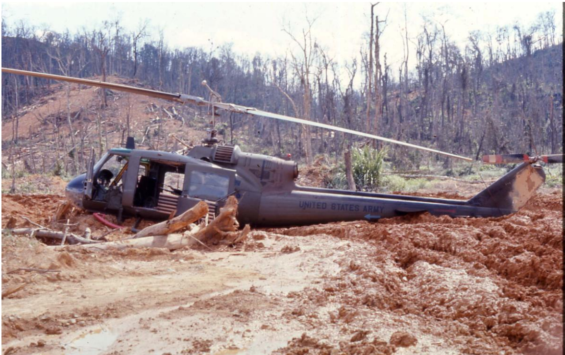
Side view - first engine failure.

Justin and Roger then tiptoed through the mud to the tail of the ship. They checked the tail rotor, and traced their path back toward the trees. The tail rotor had hit the mud all right, but it didn't appear to be damaged other than a couple minor dents. However, the whip antenna that stuck up from the tail fin was shredded. They figured the impact must have forced it over into the tail rotor. They also found a single skid mark in the mud from the stinger on the tail of the ship. The stinger was like a tail skid. It wasn't normally used, but it was there to protect the tail of the ship. In the steep flare just before the landing, they had drug the stinger quite a ways. As they looked at the marks in the mud, Roger spoke. "No wonder it leveled so easy at the end. The tail was already on the ground."