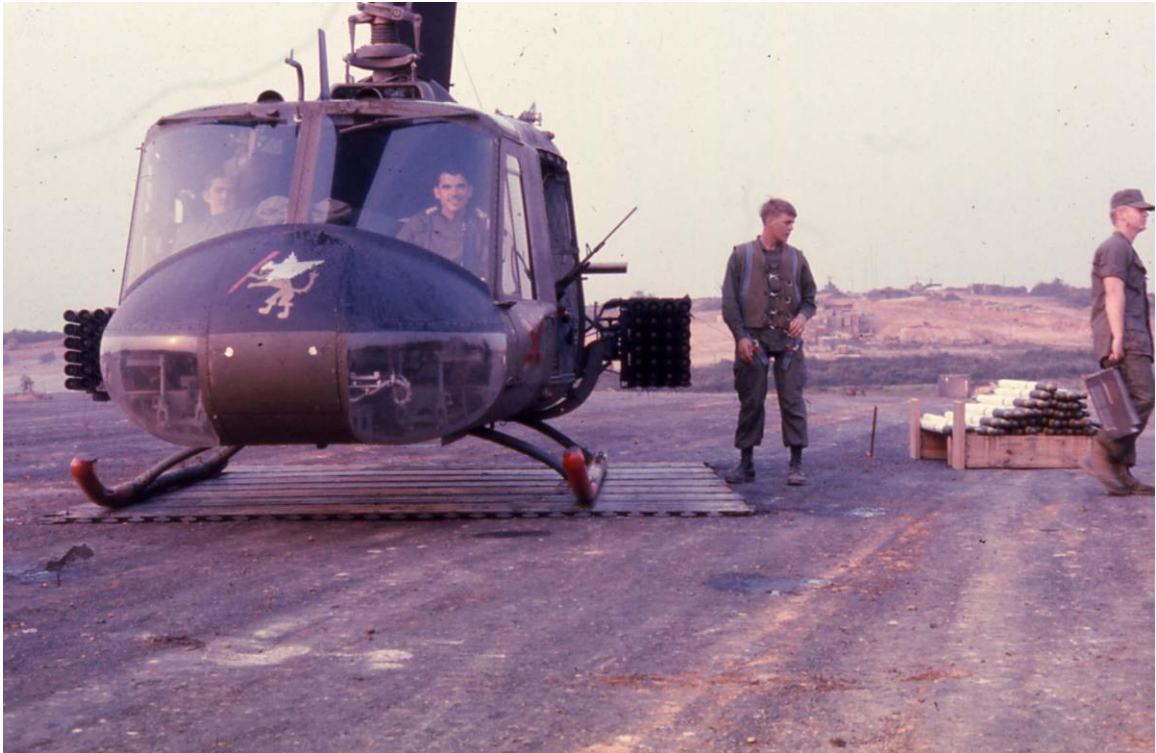
Charlie Battery flight line.

"Just be sure to watch him. He might be a major, but from what I could gather, I don't think he has any combat experience. Got that?"