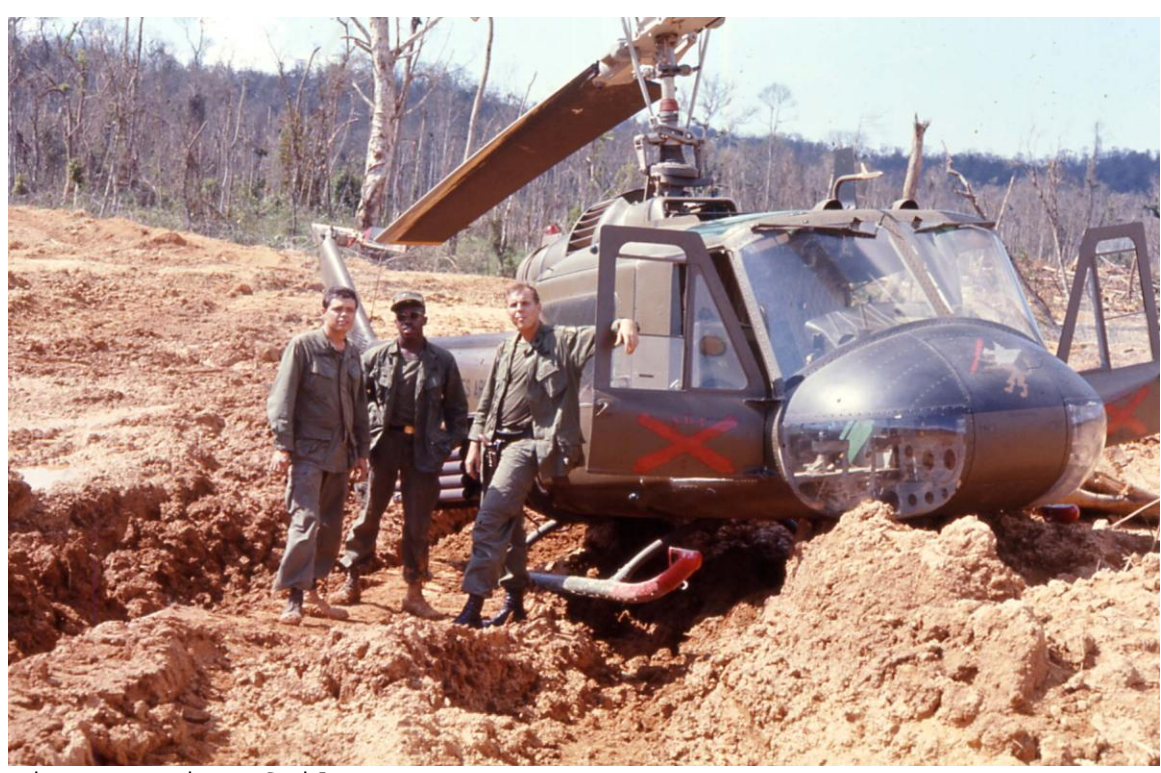
First engine failure.

"I got ahold of Kaiser again. You were right, Roger. He didn't understand the first message, but he knows where we are now." Justin turned and looked up toward a small rise behind them. "Hey, did you know those tanks were there?"