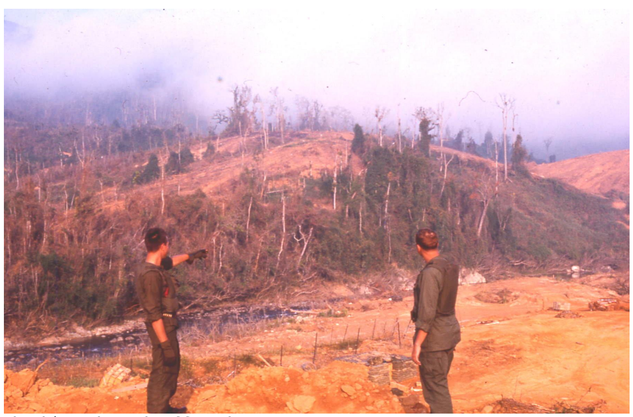
Checking the takeoff path.

ship to land as much room to take off as was possible on the short bench. During hot weather, it was absolutely necessary to bounce the ship at least twice, and usually three times, to get enough speed to get it flying on the takeoff. After they had shut down the engine, Roger and Justin walked the bench, looking carefully for anything that might endanger their takeoff. They stood at the end of the bench for a long time, looking down into the river valley. Below them, a wide area had been cleared of trees. The purpose was to clear fields of fire for the security forces on the fire base, but it also provided the choppers a reasonably clear forced landing area if they should have to abort a takeoff.