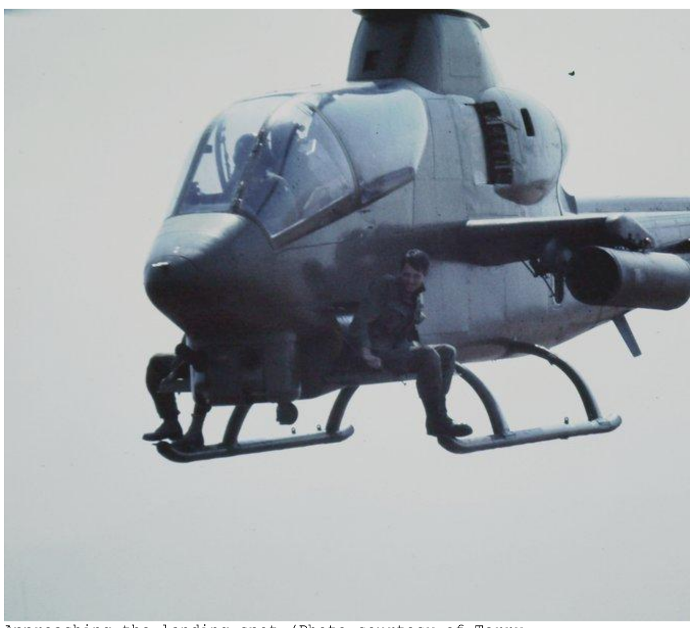
Approaching the landing spot