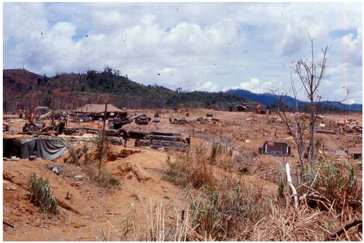
Currahee. Hamburger Hill just over the top of the parked helicopter (LOH).

The early part of May opened with plans for a large assault on the Ashau Valley. Preparations for ARA units were quite involved because the ARA had to help prep the LZ's that were to be used for troop insertions along the western flank of the valley. Few enemy positions of either .50 caliber or 37 mm. anti-aircraft weapons were known. Everyone would be largely on their own. Backup sections would be available from Camp Evans. If the action was heavy around the LZ's, then two sections were to standby at Blaze. A FSB had been established on the valley floor just west of the road entry into the valley. It was named Currahee, and was about centrally located north to south in the valley as well.