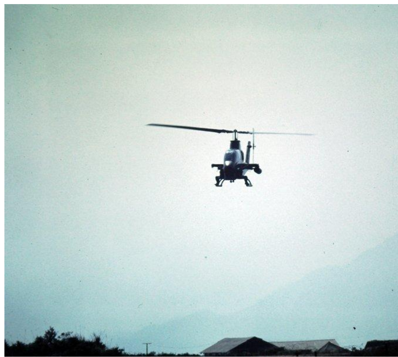
Cobra approaching Camp Evans with rescued pilots.

quickly turned and closed it. Smart did the same. As the ship lifted off for the refueling area, Smart and Hunter were greeted warmly by the assembled troops.