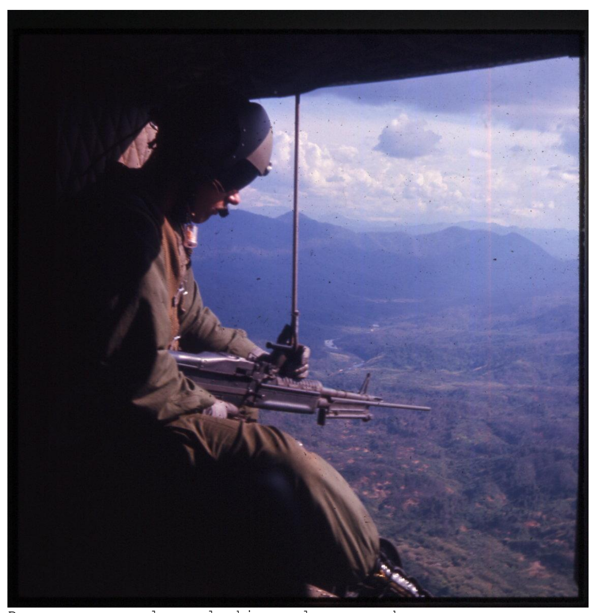
Door gunner - always looking, always ready.