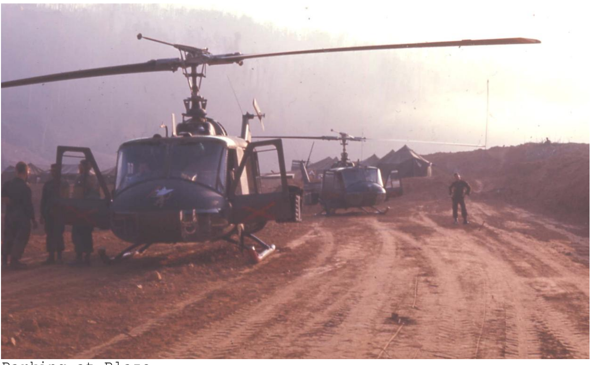
Parking at Blaze.

looked like this was a much better area. It was, until the first ship landed. FSB Blaze was west of Ann, and rested on the slopes overlooking the Song Bo River. It was just a little closer to the Ashau Valley. C Battery's parking area here was a joke. A finger ridge jutted out from the main hill mass. Along the top of this ridge was the chopper refueling area. Just below the crest of the ridge, a narrow bench had been bladed out by a cat. It reminded Roger of a wide logging road cut into the side of the hill. The bench was the parking area for ARA ships. It was only large enough to accommodate two ships. When landing, the pilots had to be careful that they didn't get too close to the bank or they would hit it with one of the main rotor blades. turbulence set up on the bench by a chopper trying to hover into position to park, was nearly unbelievable. It would literally shake the chopper.