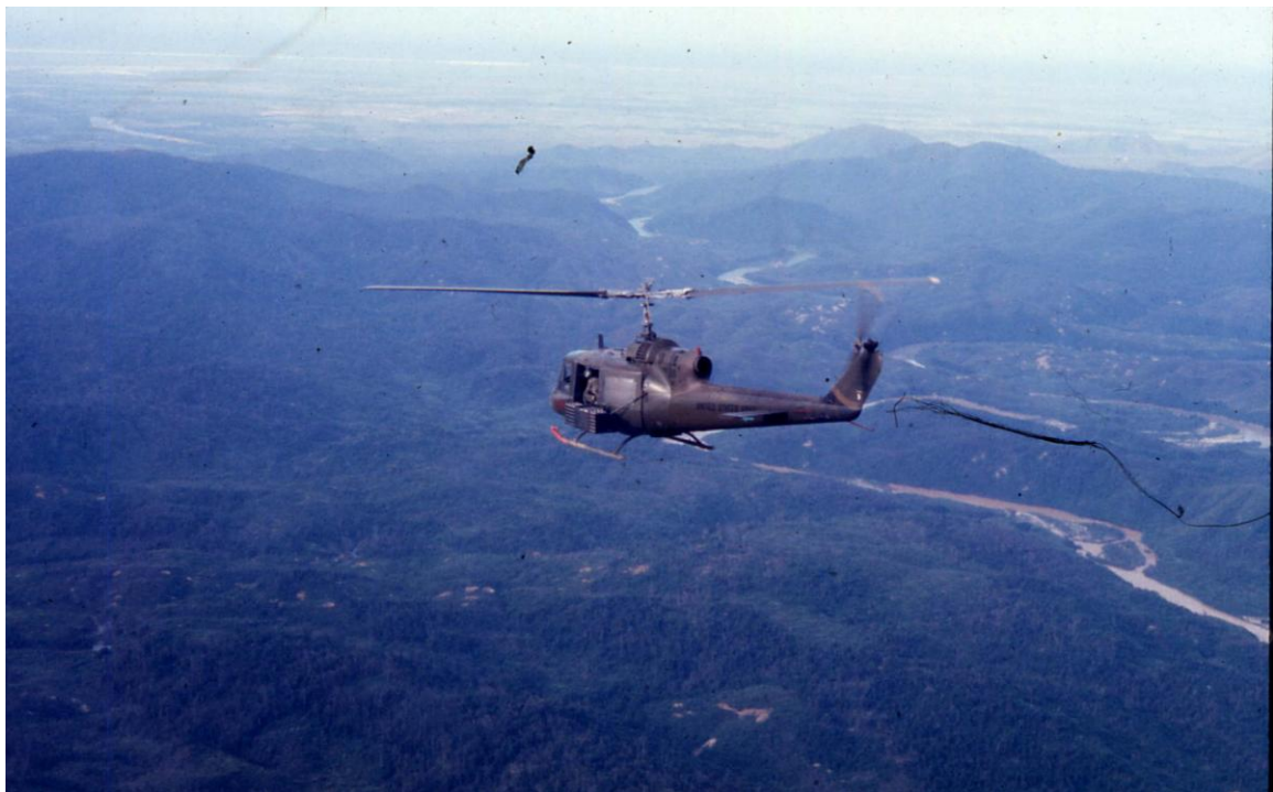
Returning to Camp Evans from the mountains along the Song Bo River.

With the coming of the dry weather, missions poured in. Day after day, the Battery put up every ship that was flyable. The maintenance personnel were working around the clock to keep all the ships flying. It was during this hectic period, that the pilots discovered a neat trick to reduce the number of hits they were taking. The enemy qunners seemed to use the nose of the aircraft as an aiming point. The pilots would kick the aircraft out of trim, so they were side-slipping through the air. Then they would smile and watch the tracers pass by the side of the ship. Return fire from the enemy was becoming more common all the time. And the stories from further north, up near the DMZ (Demilitarized Zone), demonstrated that the enemy up there were getting better training. Most of the hits taken so far by C Battery were in the tail boom or tail fins of the aircraft. Further north, the hits centered in the cockpit area, or so the stories went.