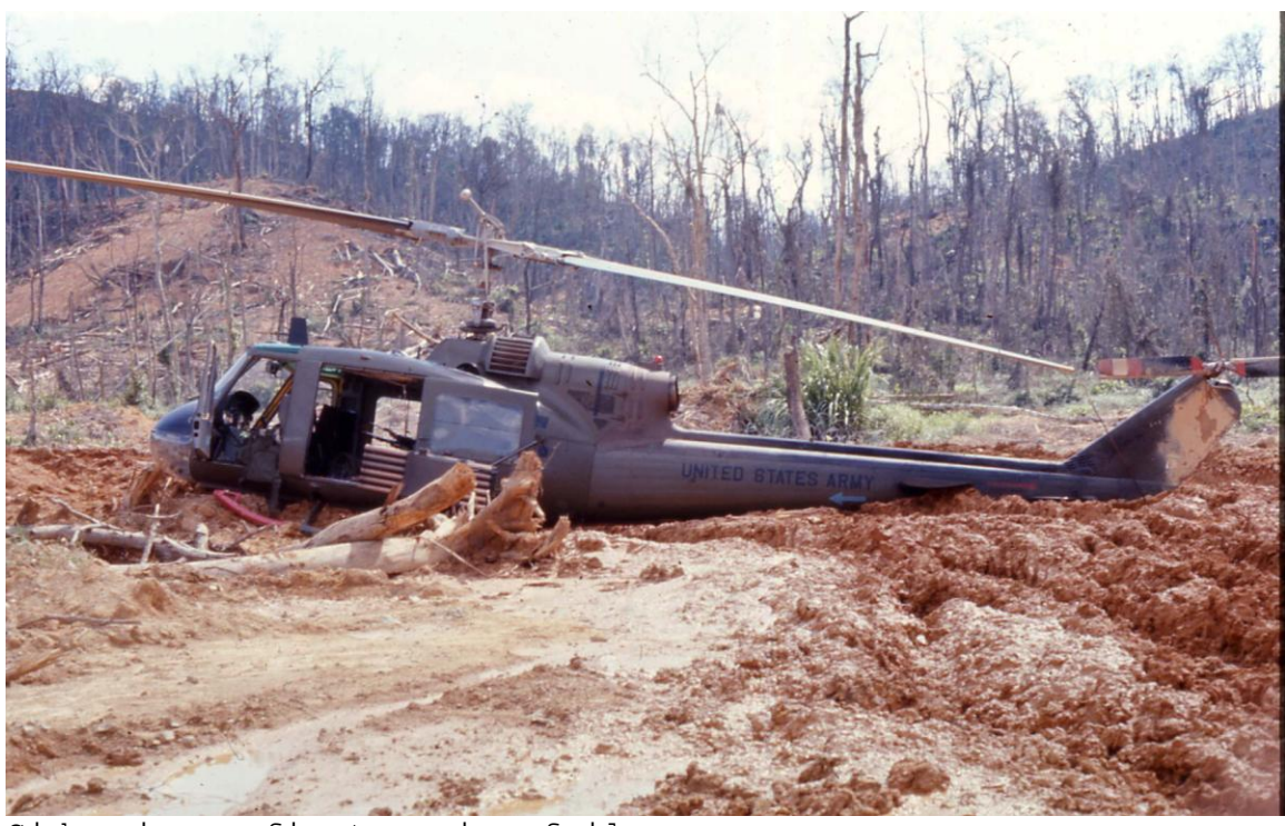
Side view - first engine failure.

Justin and Roger then tiptoed through the mud to the tail of the ship. They checked the tail rotor, and traced their path back toward the trees. The tail rotor had hit the mud all right, but it didn't appear to be damaged other than a couple minor dents. However, the whip antenna that stuck up from the tail fin was shredded. They figured the impact must have forced it over into the tail rotor. They also found a single skid mark in the mud from the stinger on the tail of the ship. The stinger was like a tail skid. It wasn't normally used, but it was there to protect the tail of the ship. In the steep flare just before the landing, they had drug the stinger quite a ways. As they looked at the marks in the mud, Roger spoke. "No wonder it leveled so easy at the end. The tail was already on the ground."