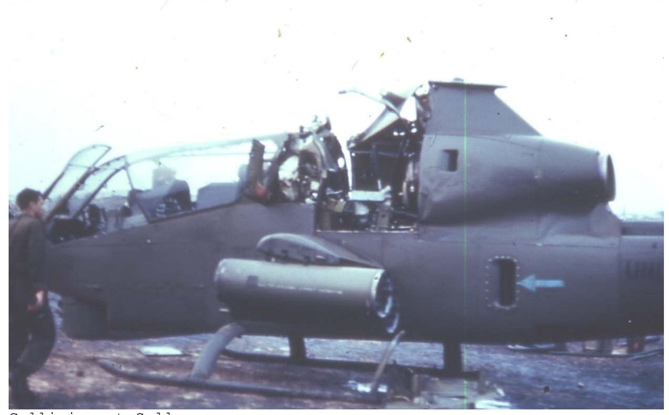
Collision at Sally.

Reaching the nose of the ship, a wide-eyed attendant was looking at the ship. Roger screamed at him, "Hey you! Get me a grounding wire!" The attendant just stood there, slack-jawed, looking at the carnage before him. "Don't just stand there! Get me a grounding wire!" Roger screamed again. The attendant took one last look, and turned and fled. Roger never saw him again. Roger wanted to get the ship grounded as quickly as possible to keep it from blowing up. Stumbling around the aircraft, he reached the open canopy for the front seat.