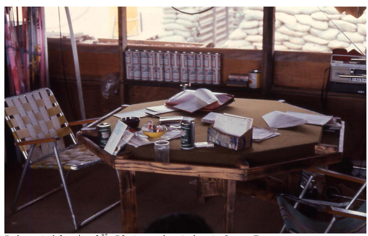
Poker table in 1<sup>st</sup> Platoon hootch at Camp Evans.

volleyball net had been set up, and it wasn't long before an earnest game was in progress. It was a nice break from the otherwise steady flow of missions. The other Batteries had agreed to take over C Battery's missions for the day. That night, one of the first movies to reach the unit was shown in the vehicle maintenance tent. It was rather a crude affair, but did provide a little change of pace for evening activities. Otherwise it was poker games, reading books or writing letters. However, the scenes shot with a wide-angle lens were distorted, and the figures appeared tall and thin on the screen. When women were shown, the troops yelled and whistled and generally cut up.