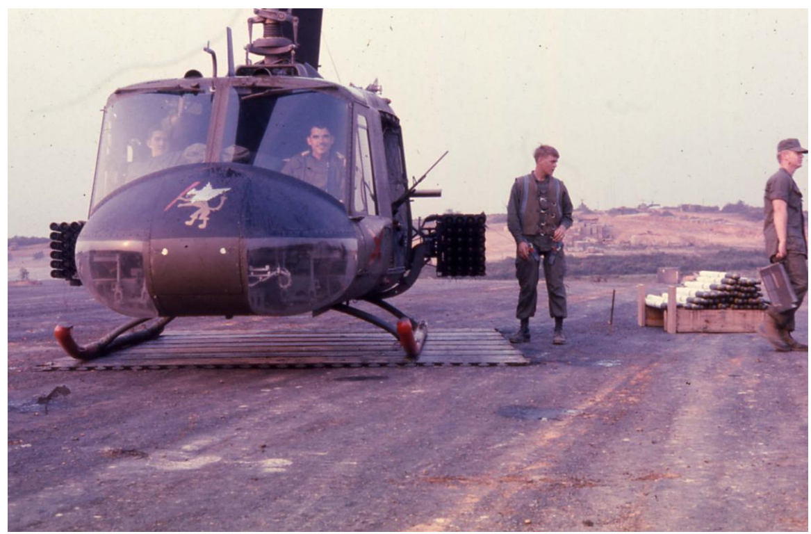
Charlie Battery flight line.

"Just be sure to watch him. He might be a major, but from what I could gather, I don't think he has any combat experience. Got that?"